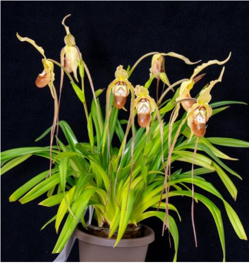
Phrag. Mini Grande Grown by Marc Adolph