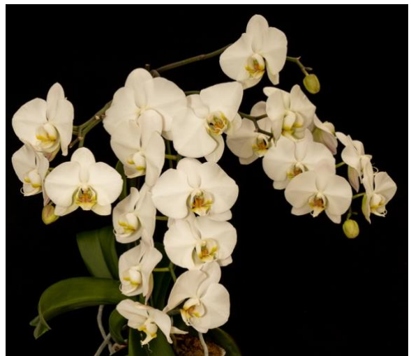
Phalaenopsis Yukimai Grown by Sylvia Eastwood