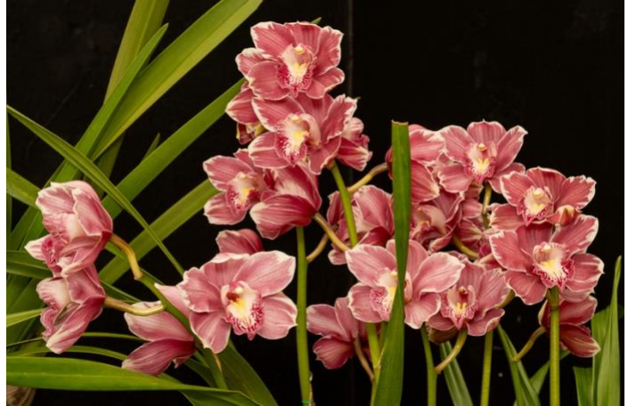
Cymbidium Pia Borg 'Flash' Grown by Dave Streeter